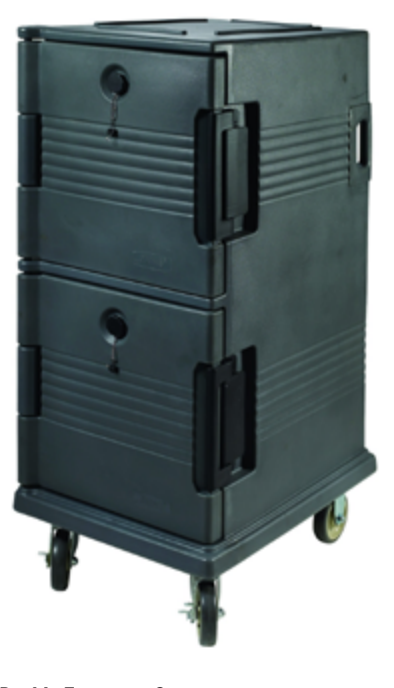
Double Transport Case

Double Cabinet Insulated Food Pan Transporter w/ Built-in Dolly