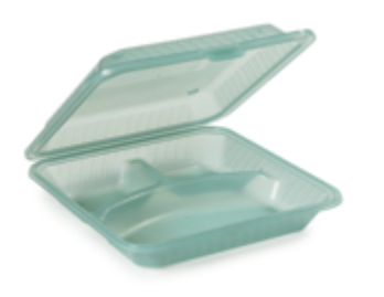
3-Compartment Food Container EC-12-1- 9" x 9", 2.75" tall 1 dz. 23 cm x 23 cm, 7 cm