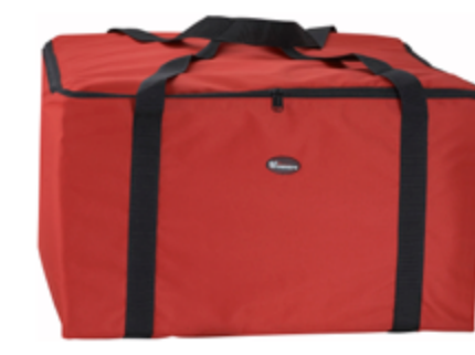
Insulated Delivery Bag BGDV-22 22" x 22" x 12"