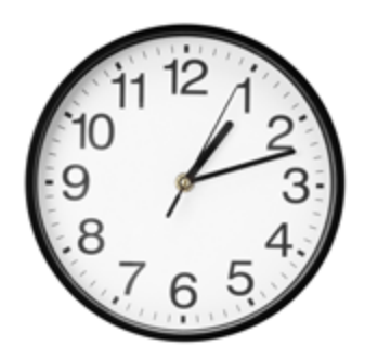
If a drying agent is not an option, plan time for them to dry before stacking as plastic naturally dries more slowly than porcelain and glass

Request a Sample: https://resources.get-melamine.com/get-sample-request