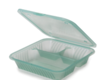
3-Compartment Food Container