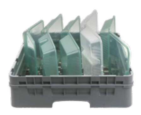
Angle opened containers at 30° in a peg dish rack for thorough sanitation

This Rinse Aid is specially designed to sheet rinse water off faster from any plastic to speed drying and is very effective with Eco Takeouts.