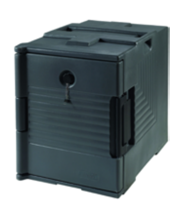
Single Transport Case