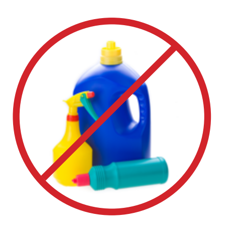
Always use a bleach-free detergent