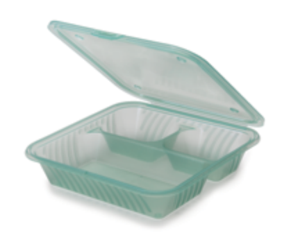
Use a special rinse aid designed for plastic