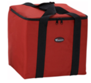
Insulated Delivery Bag BGDV-12 12" x 12" x 12"