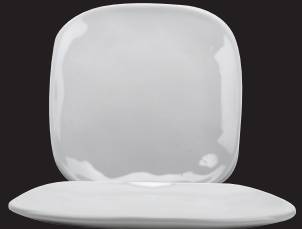
SCS-9-AM-W Square Plate 9.5" 1 dz.