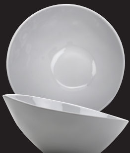
B-792-AM-W Cascading Bowl 24 oz. 9.2" dia. 2.75" deep (front) 4.75" (back) 1 dz.