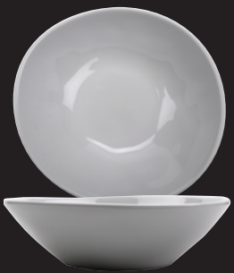
B-18-AM-W Round Bowl 16 oz. 7" dia. 1.75" deep 1 dz.