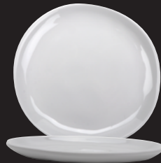
CS-7-AM-W Round Plate 7" dia. 1 dz.