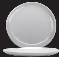
CS-5-AM-W Round Plate 5.5" dia. 4 dz.