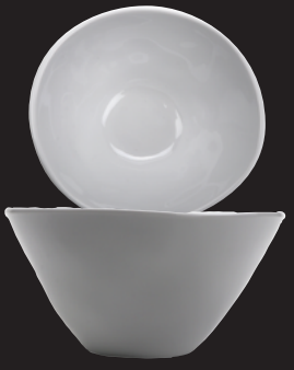
B-22-AM-W Round Bowl 22 oz. 6.25" dia. 2.75" deep 1 dz.