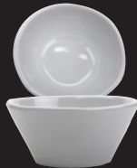
B-3-AM-W Round Ramekin 3 oz. 3.25" dia. 1.6" deep 1 dz.