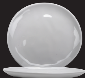
CS-9-AM-W Round Plate 9" dia. 1 dz.