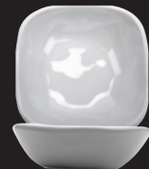
SB-5-AM-W Square Monkey Dish 5 oz. 4.25" length 1" deep 4 dz.