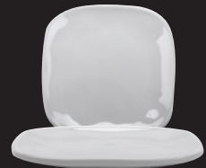
SCS-6-AM-W Square Plate 6" 2 dz.