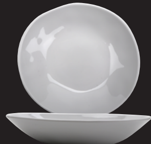
B-42-AM-W Round Bowl 1.3 qt. 10" dia. 1.75" deep 1 dz.