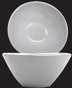
B-8-AM-W Round Bowl 8 oz. 5" dia. 2" deep 2 dz.