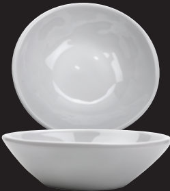
B-5-AM-W Round Monkey Dish 5 oz. 4.25" dia. 1.5" deep 6 dz.