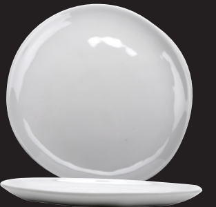
CS-10-AM-W Round Plate 10.5" dia. 1 dz.