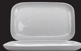
CS-117-AM-W Rectangular Platter 12" x 7.5" 1 dz.