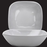
SB-14-AM-W Square Bowl 14 oz. 6" length 1.5" deep 2 dz.