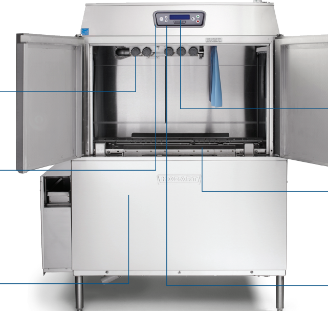
CL44eN-ADV ILLUSTRATED ABOVE

ACTUATES DRAIN CLOSURE AUTOMATICALLY AFTER CLOSING DOOR. ELIMINATES EXTRA MANUAL STEPS AND ENSURES THAT CLOSURE IS ALWAYS IN THE CORRECT POSITION.